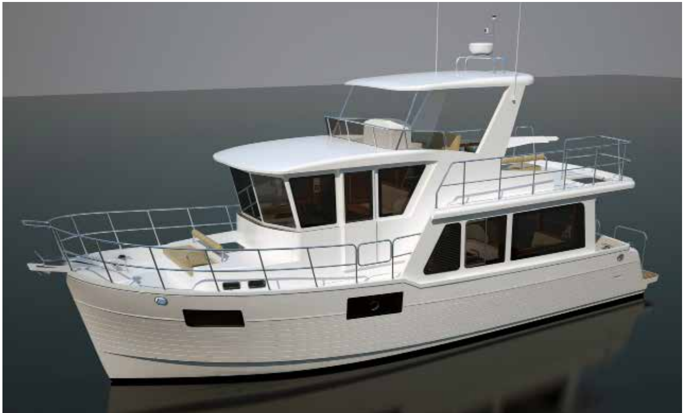
NORTH PACIFIC YACHTS