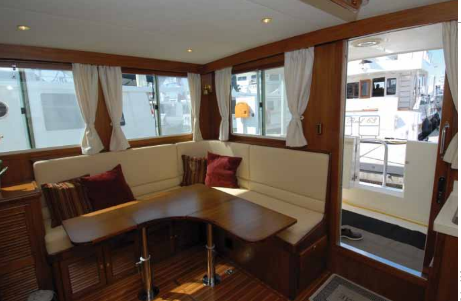
Robert M. Lane

Before we passed the outermost red marker, the North Pacific had shown she wasn't the least bit intimidated by 2- and 3-foot seas; it seemed almost like fun as we ran bow-on into sharply breaking waves that were challenging, but well short of being dangerous. The worst part, truly, was a near-tropical downpour that fogged the view ahead.