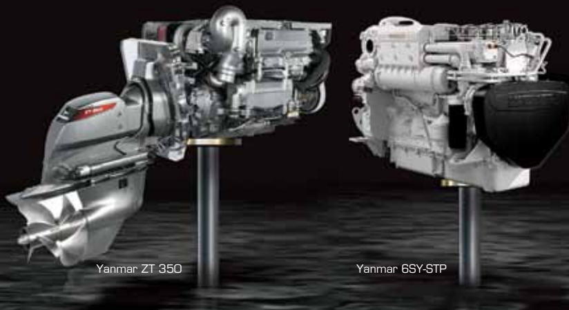
Yanmar ZT 350

low noise ■ extreme reliability ■ maximum efficiency