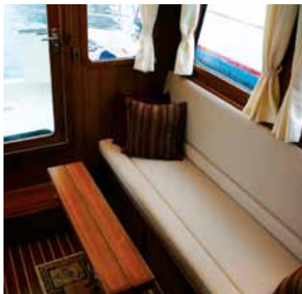
➔ Above & Right This 28-footer has a well thought out cabin plan, with a long, linear galley to starboard, a pull-out settee to port, and plenty of teak to keep things cozy.

teries and single 4D AGM starting battery. This is plenty of battery power to operate the ship's systems and the standard 1,500-watt inverter. An Espar diesel heater and pressure fresh water system with 6-gallon heater are also standard. Despite being built in China, all the systems and equipment aboard the 28 are available off-the-shelf in North America, so replacement parts and service won't be a problem. ▶