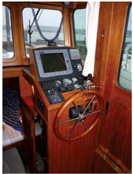
PETER A. ROBSON

↓ Below The compact and cozy pilothouse is two steps up from the saloon.