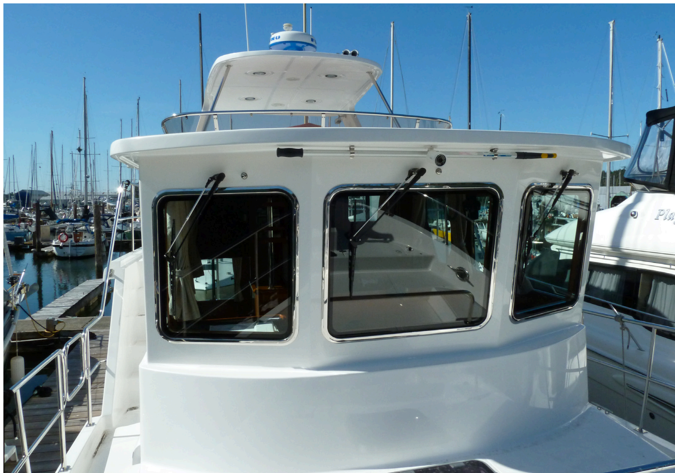
FORWARD-RAKED PILOTHOUSE WINDOWS GIVE THE 45 A WORKBOAT-INSPIRED LOOK.

The helm console holds engine instruments, controls, autopilot and two large multi-function displays (Fu-runo on Migration ). Skippers who like their paper will appreciate the two generous "chart" surfaces to port and starboard of the helm. Drawers and lockers under