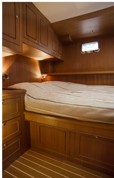
THE PORTSIDE STATEROOM CAN BE EQUIPPED AS AN OFFICE, SITTING ROOM OR SLEEPING ACCOMMODATION. MIGRATION'S IS FITTED WITH A DOUBLE BERTH.

The 45 is boarded through a central transom door, over a generous swim platform, or through a starboard-side door that leads directly into the cockpit. A hatch in the cockpit floor opens to the lazarette, a huge space that holds a Hurricane hydronic heating system, all of the ship's batteries, a Magnum inverter/charger and the emergency tiller, with easy access