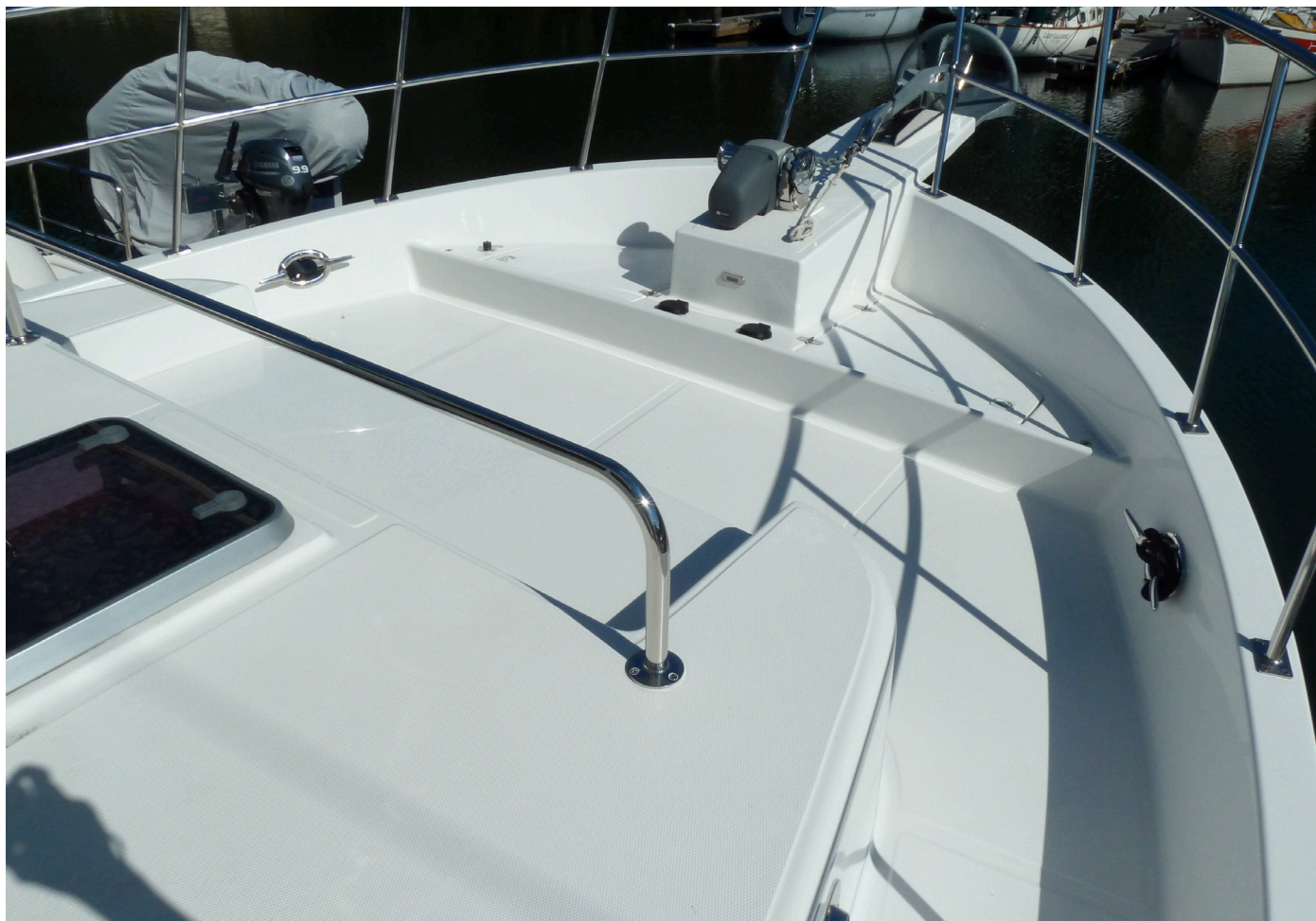
THE FOREDECK INCORPORATES A BENCH SEAT AND DEEP TWIN LOCKERS BESIDE THE WINDLASS PEDESTAL.

After an entirely dry ride, she took one or two big ones at top speed. Her high bow deflected most of the spray, the raked windows shed more of it, and the wipers quickly cleaned up the rest. But always, the ride was stable, steady and very quiet at cruise. When we turned downwind for home, the speed settled at 7.5 knots at 1,500 RPM and 2.9 GPH, a typical cruising speed in smooth water.