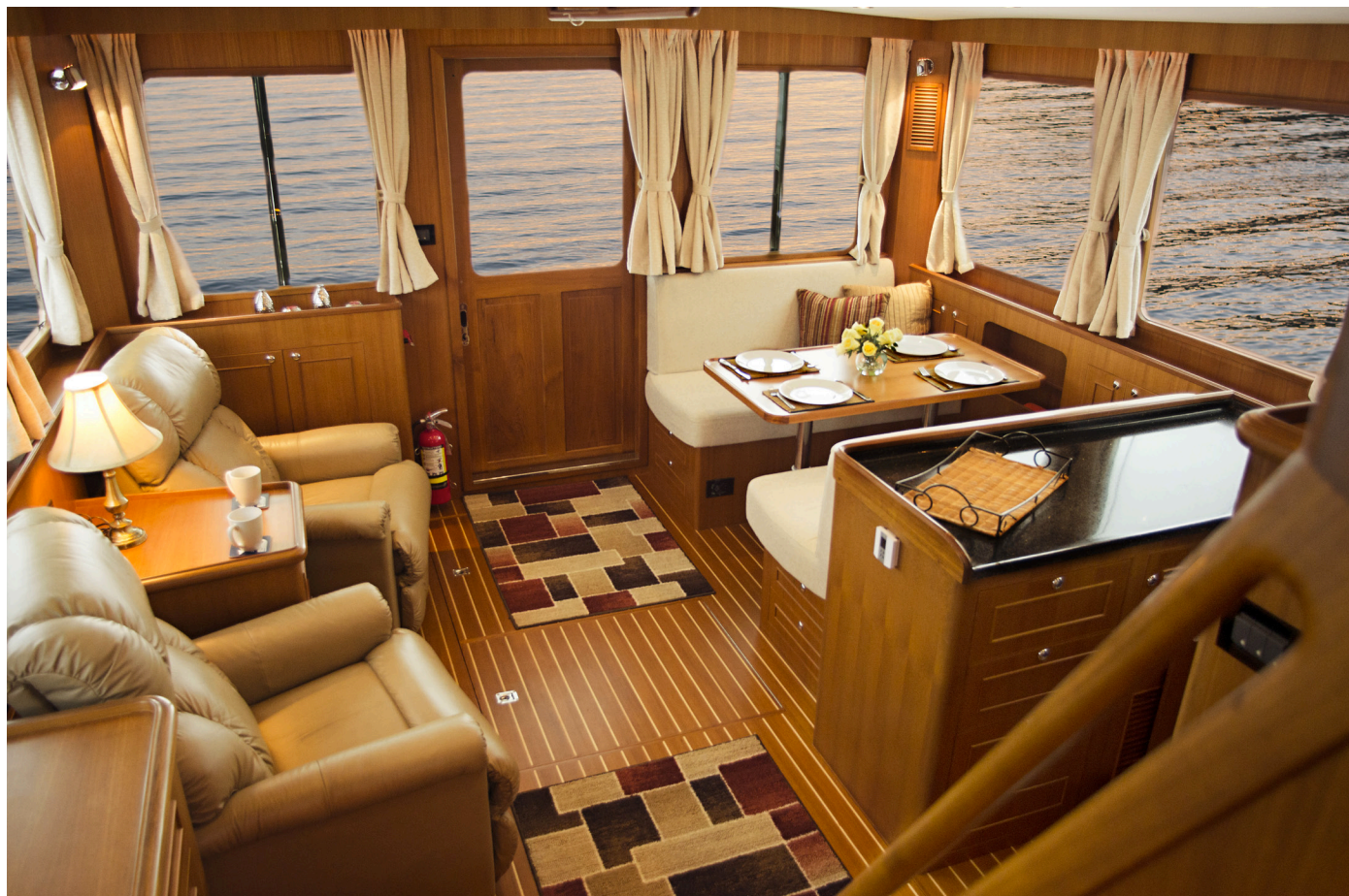
THE 45'S FULL-BEAM SALOON IS BRIGHT, SPACIOUS AND IDEAL FOR SOCIALIZING OR LOUNGING.

they improve visibility in inclement weather while opening up space in the pilothouse.