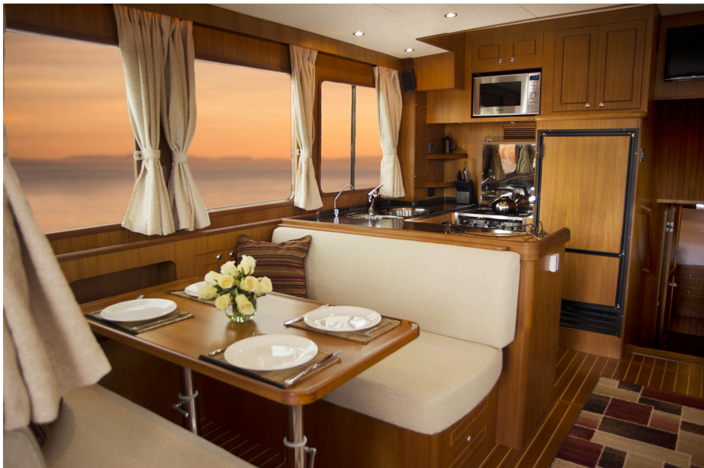
THE DINETTE SEATS SIX. FROM THE GALLEY, THE CHEF CAN STAY IN TOUCH WITH GUESTS AT ALL TIMES.

to the steering system and stern thruster – and lots room left over for all the usual deck gear that lives down here.