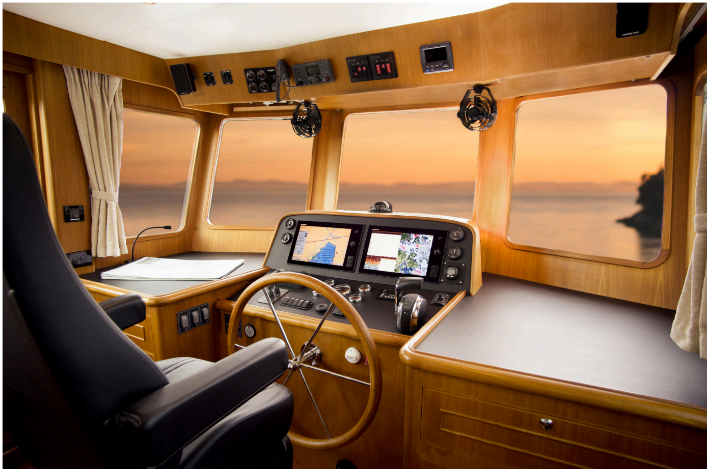
THE PILOTHOUSE IS ROOMY, BUSINESSLIKE AND COMFORTABLE FOR LONG RUNS.

Among the most notable recent success stories in the Northwest boat industry is that of North Pacific Yachts of Delta, British Columbia. In just over a decade, the company has delivered about 110 trawler-cruisers to owners on the East and West Coasts and built a reputation for providing excellent livability, finish and value at competitive prices.