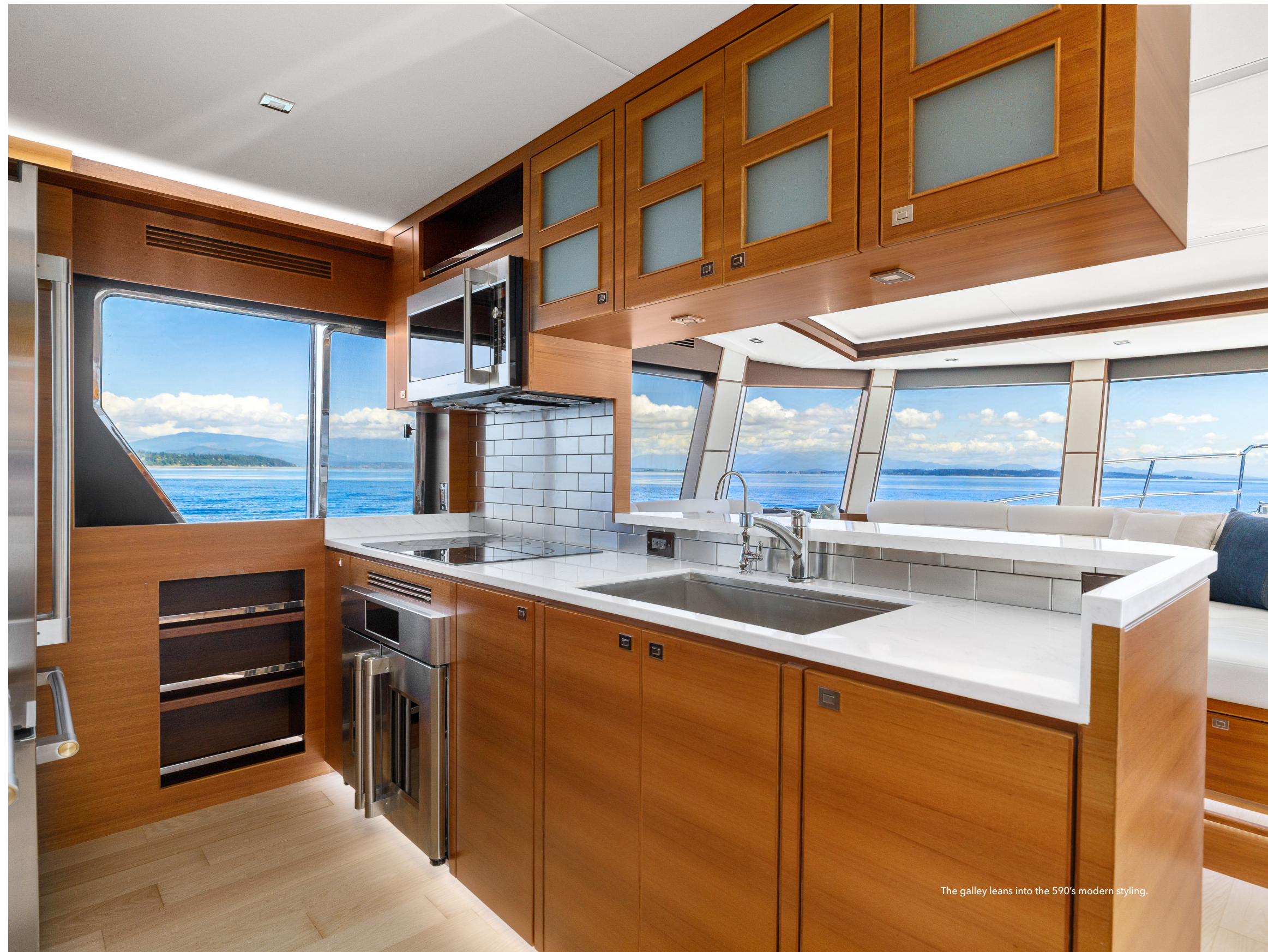
The galley leans into the 590's modern styling.