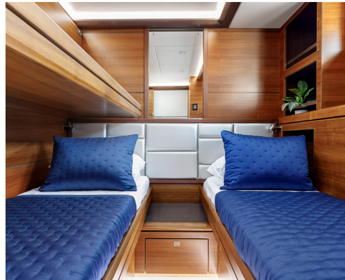
Clockwise, from top: The full-beam master stateroom; In the guest stateroom, the twin berths slide together to make a double; Hull windows grace the master bath with light and stunning views.