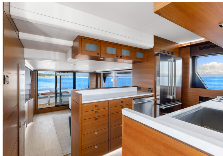
Above: The amidship galley separates the salon from the forward dinette. Below: The dinette looks is an ideal perch to watch the world go by. The 590 can also be ordered with a lower helm here.

A similar set of gracefully curved stairs from the salon accesses the engine room, lazarette and engineering room, including tools and a workbench. There's a single berth here for crew or overflow, and owners can nix the engineering room in favor of a head and shower.