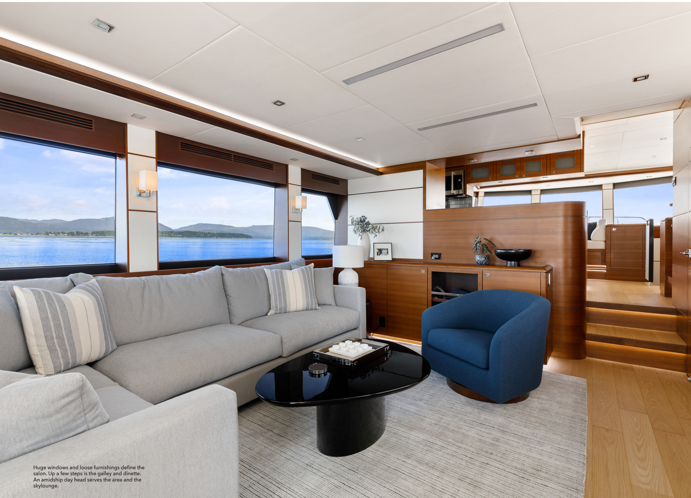
Huge windows and loose furnishings define the salon. Up a few steps is the galley and dinette. An amidship day head serves the area and the skylounge.