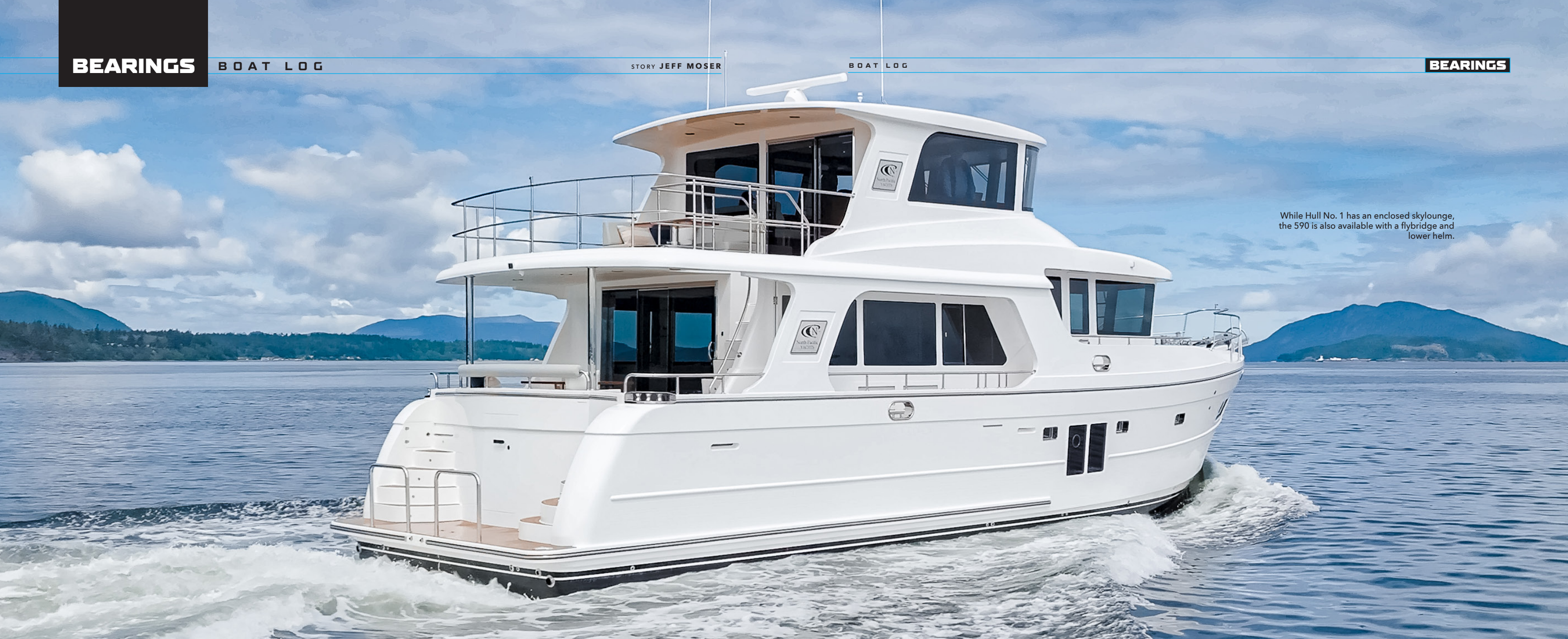
While Hull No. 1 has an enclosed skylounge, the 590 is also available with a flybridge and lower helm.