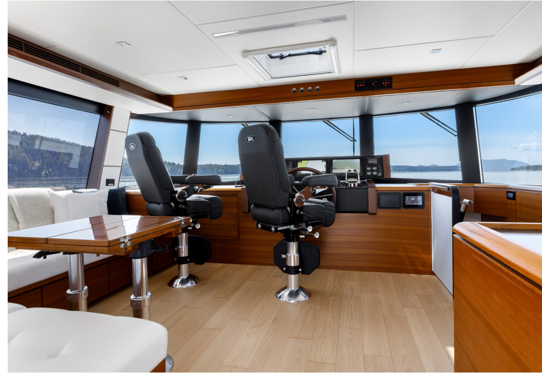
From top: The skylounge helm, where five forward-facing windows and rectangular side glass give the captain a wide range of visibility; An evening on the hook.

The owners of Hull No. 1 have used her extensively since taking delivery in late May. They summured in Puget Sound and completed a circumnavigation of Vancouver Island. They spend significant time on the hook in remote anchorages, so the boat is outfitted with a beefy, dual-anchor windlass, an FCI watermaker and a LiON battery suite mated to Victron chargers and inverters, all backed by a 20-kW Northern Lights genset.