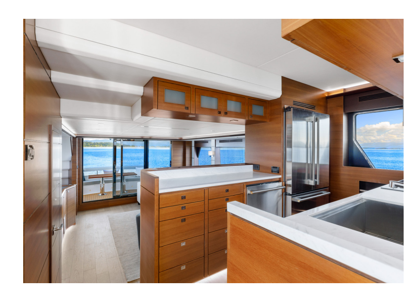
Above: The amidship galley separates the salon from the forward dinette. Below: The dinette looks is an ideal perch to watch the world go by. The 590 can also be ordered with a lower helm here.

A similar set of gracefully curved stairs from the salon accesses the engine room, lazarette and engineering room, including tools and a workbench. There's a single berth here for crew or overflow, and owners can nix the engineering room in favor of a head and shower.